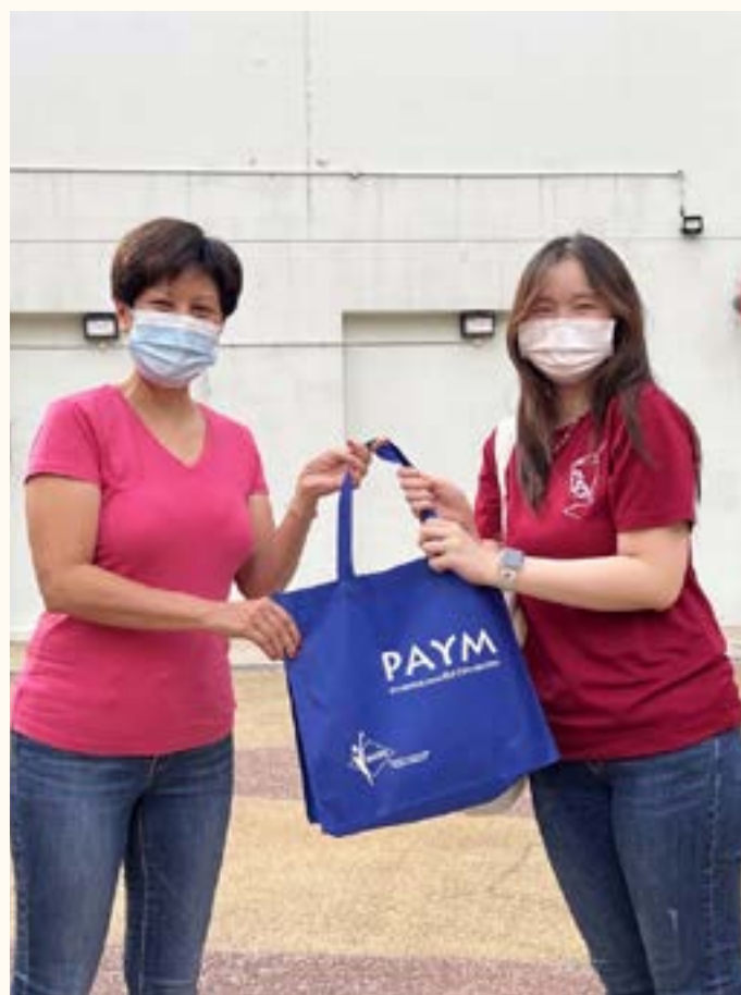
Celebrating Christmas with families living in rental blocks.

Focus and grow at your own pace, in your own style and through your own ways. These are what helps in self-discovery and stand out. Write the chapters that are unique to you.