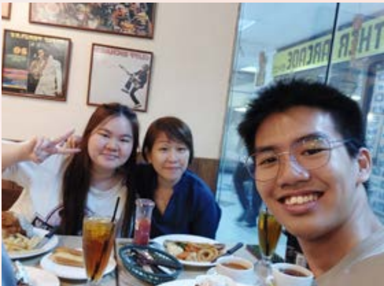
Erudites - Post Event Prep Dinner

Through my CCAs, I discovered profound joy in creating experiences for people that either inspire them or help them with their personal journey. I witnessed firsthand the power of interactive storytelling and development in igniting curiosity and passion.