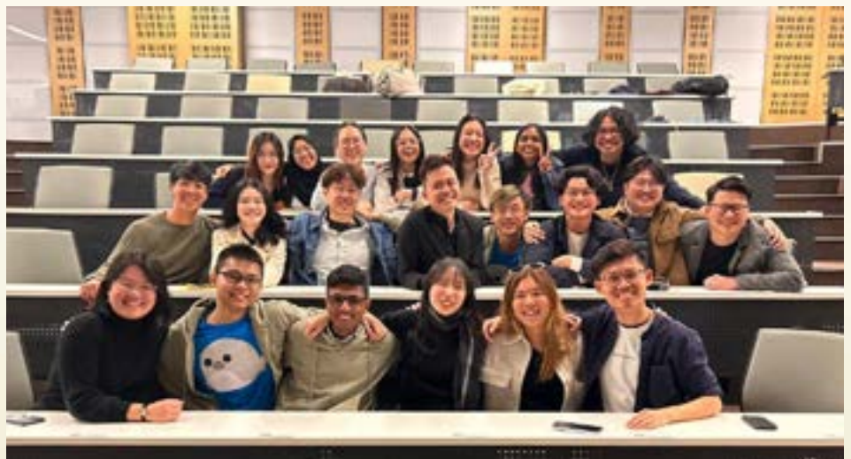
Overseas Merit Fellowship Meeting

For fellow students hesitating to apply, my advice is to take a leap of faith - there is no harm in trying. I was unsure of my suitability and worth in comparison to others, but recognised that applying opens doors to personal growth, skill development, and a step closer to aspirations. While scholarships may be competitive, not trying means missing out on the opportunity to discover one's standing and potential for growth.